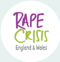
Rape Crisis 0808 802 9999