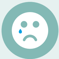
Crying a lot