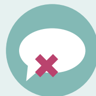
Not feeling like talking