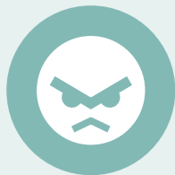
Feeling very angry