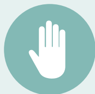
Wanting to keep control